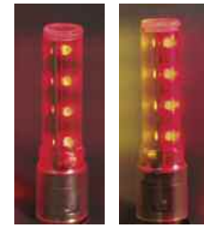
AL8CR Red (non-flashing) AL8CAR Amber, Red (non-flashing)