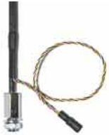
Standard Connect Version Shown on Black Sheathing Stainless Steel Rod with Stainless Steel Base.