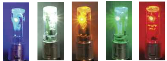
AL2CB Blue AL2CW White AL2CA Amber AL2CR Red AL2CG Green

Extra bright and available in 5 colors. This tough light is completely filled with optically clear gel for added robustness. shown at below.