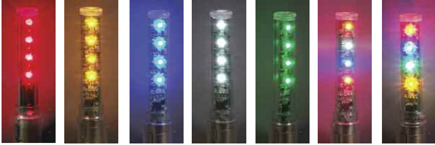
AL8FR Red flashing AL8FA Amber flashing AL8FB Blue flashing AL8FW White flashing AL8FG Green flashing AL8FUSA R,W,B,R flashing AL8FMULTI R,G,B,A flashing