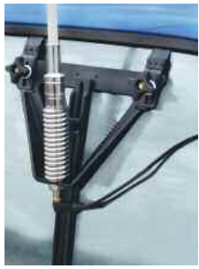
Window Mount 519.320