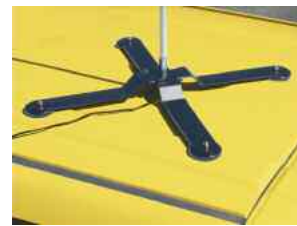
Magnet Mount 519.330

519.310 Heavy Duty Stainless Steel Spring Mount : Highly recommended to help reduce whip breakage.